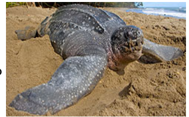
Leatherback Sea Turtle

Experience the traditions of democracy, peace, and hospitality in the rich cultural heritage of Costa Rica as you travel to and fro by bus and boat, with great hiking and snorkeling in-between.