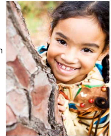
WEEB Grant Impact 2006-07 cycle

The grants program provides funds for energy, forestry and general environmental education projects throughout Wisconsin's communities.