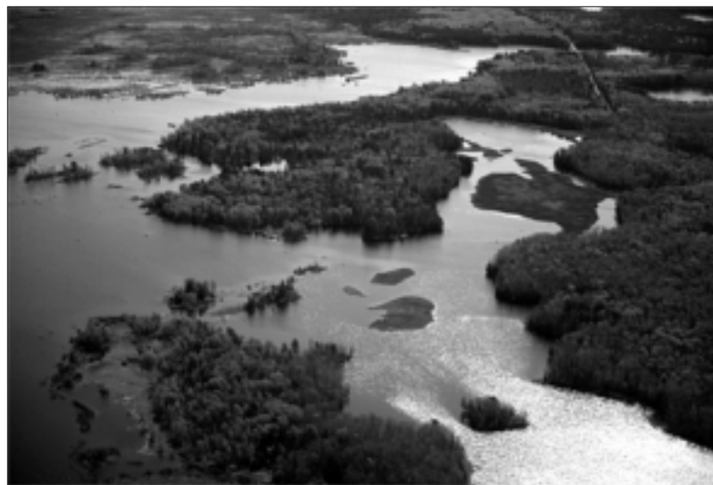
Lakes and Land...it's all connected!

The mineral content of water can be increased more than 100-fold after the water has moved only a few meters.