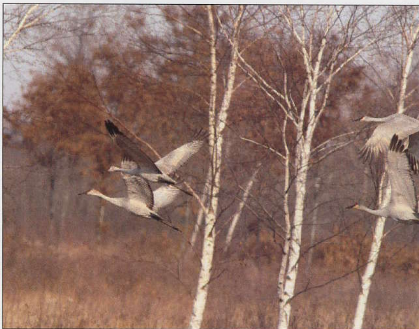
Each spring close to 3,000 volunteers participate in the Annual Midwest Crane Count. Here, a flock of Sandhills take off over Crex Meadows in northwest Wisconsin.

These are only some of the scientific benefits that arise through continuing the Crane Count. But what do the people involved get out of the project? Answering this question is just as important as the scientific elements of the Crane Count.