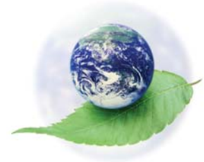
World Environment Day June 5, 2007

February 15, 2008: WEEB Grant and Lowes Outdoor Classroom Grant Proposals Due