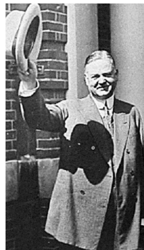
One of the nation's earliest advocates for zoning was then Secretary of Commerce Herbert Hoover.

This year marks the 75th anniversary of the landmark United States Supreme Court case Euclid v. Ambler Realty , which upheld the basic constitutionality of local zoning. Zoning's original supporters included both progressives and conservatives who shared a belief in the power of planning to improve people's lives. In fact, it was former President Herbert Hoover, who as U.S. Secretary of Commerce, chaired the commission which drafted the first model zoning enabling act. As Hoover noted in a foreword to the model act: "the discovery that it is practical by city zoning to carry out reasonably